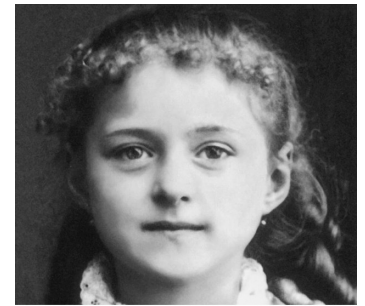
ST. THERESE OF LISIEUX

"Therese of the Child Jesus and the Holy Face is the youngest of all the "Doctors of the Church", but her ardent spiritual journey shows such maturity, and the insights of faith expressed in her writings are so vast and profound that they deserve a place among the great spiritual masters. "